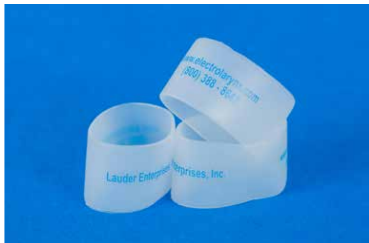
REF LAU01 Lauder Elastiband