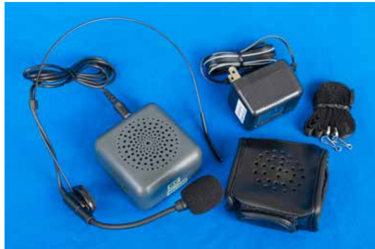
REF SP01 Spokeman Voice Amplifier

Carry case and strap allows you to carry it over your shoulder, fasten it around your waist or Velcro® it around your belt. Or take the Spokeman out of the case and set it on a table, desk or night stand. Has an on/off/volume knob. Runs on rechargeable AAA batteries, the Spokeman can also use 6 standard AAA alkaline, non-rechargeable batteries if you prefer. It even has a jack to amplify CD players, small radios, or communication boards.