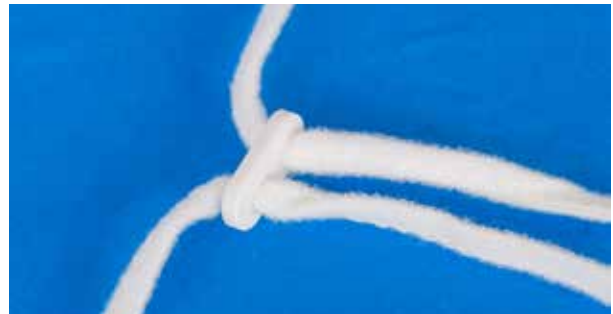
New adjustable Easy-Tie strap fitting