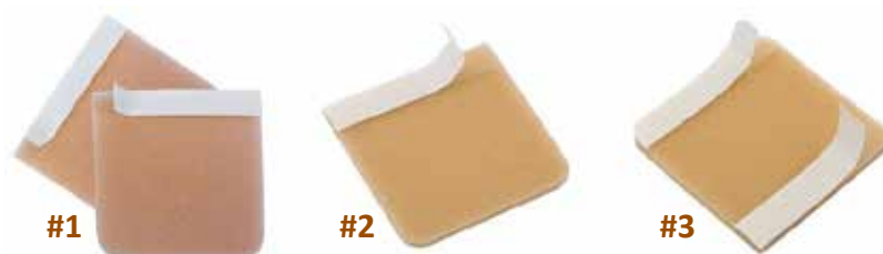
all foam varies somewhat in color from piece to piece