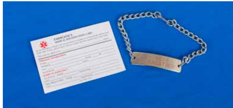
REF ID01 Medical ID Bracelet